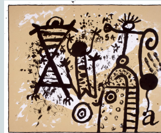
Earth Spirit Dance