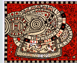
Rune Reader I