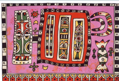
To a Celtic Spirit II