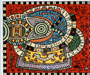
Rune Reader II